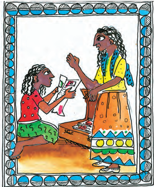
hospitals were separate and so were ambulances. An ambulance meant for white people would always be well equipped while one meant for black people was not. There were separate trains and buses. Even the busstops were different for black and white people.

Non-whites were not allowed to vote. The best land in the country was reserved for the white people, and nonwhites had to live on the worst available land. Thus blacks and coloured people were not considered to be equal to whites.