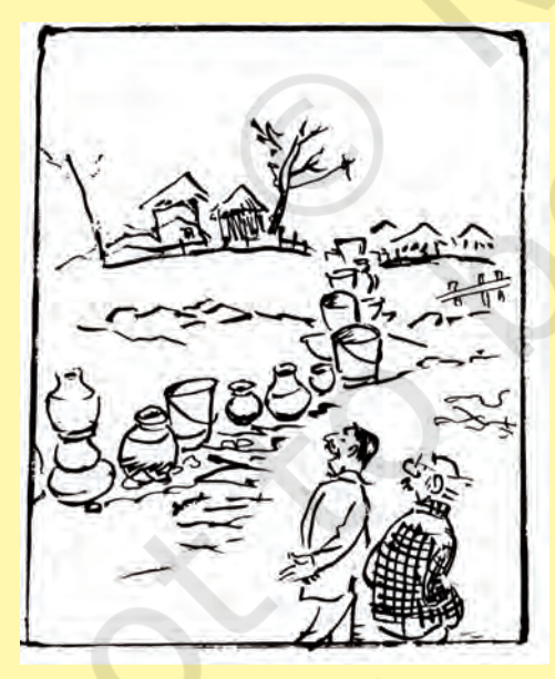
Not bad! One of the taps in the nearby village must be getting water!

What approval or disapproval is being expressed here?