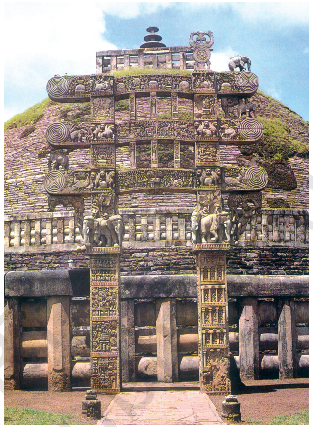
Top : The Great Stupa at Sanchi, Madhya Pradesh.

Some of the earliest Hindu temples were also built at this time. Deities such as Vishnu, Shiva, and Durga were worshipped in these shrines. The most important part of the temple was the room known as the garbhagriha , where the image of the chief deity was placed. It was here that priests performed religious rituals, and devotees offered worship to the deity.