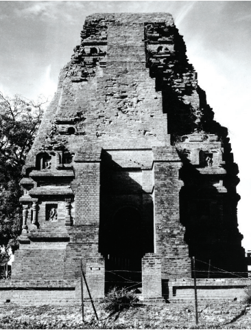
Top : An early temple at Bhitargaon, Uttar Pradesh.

This was built about 1500 years ago, and was made of baked brick and stone.