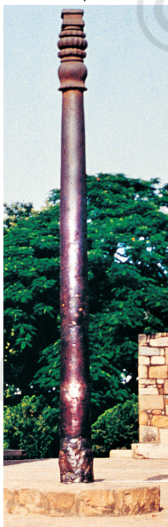
The iron pillar

on the pillar mentioning a ruler named Chandra, who probably belonged to the Gupta dynasty (Chapter 10). What is amazing is the fact that the pillar has not rusted in all these years.