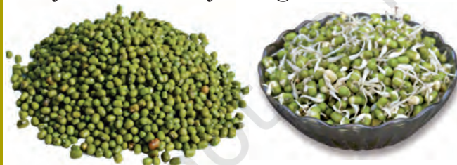
Fig. 1.5 Whole moong and its sprouts

Take some dry seeds of moong or chana . Put a small quantity of seeds in a container filled with water and leave this aside for a day. Next day, drain the water completely and leave the seeds in the vessel. Wrap them with a piece of wet cloth and set aside. The following day, do you observe any changes in the seeds?