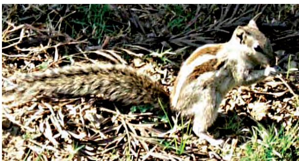
Fig. 1.8 Squirrel eating nuts

You will then surely be aware of the food, the animal eats. What about other animals? Have you ever observed what a squirrel (Fig 1.8), pigeon, lizard or a small insect may be eating as their food?