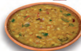
(a) Plant sources