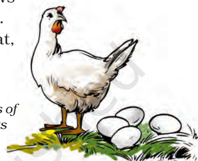
(b) Animal sources