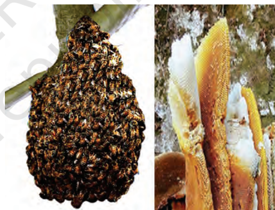
Fig. 1.7 Beehive

Do you know where honey comes from, or how it is produced? Have you seen a beehive where so many bees keep buzzing about? Bees collect nectar (sweet juices) from flowers, convert it