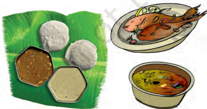
Fig. 1.1 Different food items

There seems to be so much variety in the food that we eat (Fig 1.1). What are these food items made of?