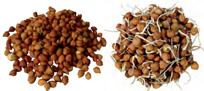
Fig. 1.6 Chana (gram) and its sprouts

A small white structure may have grown out of the seeds. If so, the seeds have sprouted (Fig. 1.5 and 1.6). If not, wash the seeds in water, drain the water and leave them aside for another day,