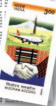
मिज़ोरम सम्मोह MIZORAM ACCORD

The Times of India News Service NEW DELHI, June 25: Directorate of Revenue (DOR) has seized Rs 2 crore worth of gold in a Comptroller's office in 11 houses at this morning.