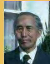
Angami Zapu Phizo

Assam accord brought peace and changed the face of politics in Assam, but it did not solve the problem of immigration. The issue of the 'outsiders' continues to be a live issue in the politics of Assam