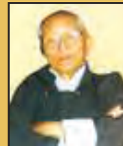
Kazi Lhendup Dorji Khangsarpa (1904):

The first democratic elections to Sikkim assembly in 1974 were swept by Sikkim Congress which stood for greater integration with India. The assembly first sought the status of 'associate state' and then in April 1975 passed a resolution asking for full integration with India. This was followed by a hurriedly organised referendum that put a stamp of popular approval on the assembly's request. The Indian Parliament accepted this request immediately and Sikkim became the 22nd State of the Indian union. Chogyal did not accept this merger and his supporters accused the Government of India of foul play and use of force. Yet the merger enjoyed popular support and did not become a divisive issue in Sikkim's politics.