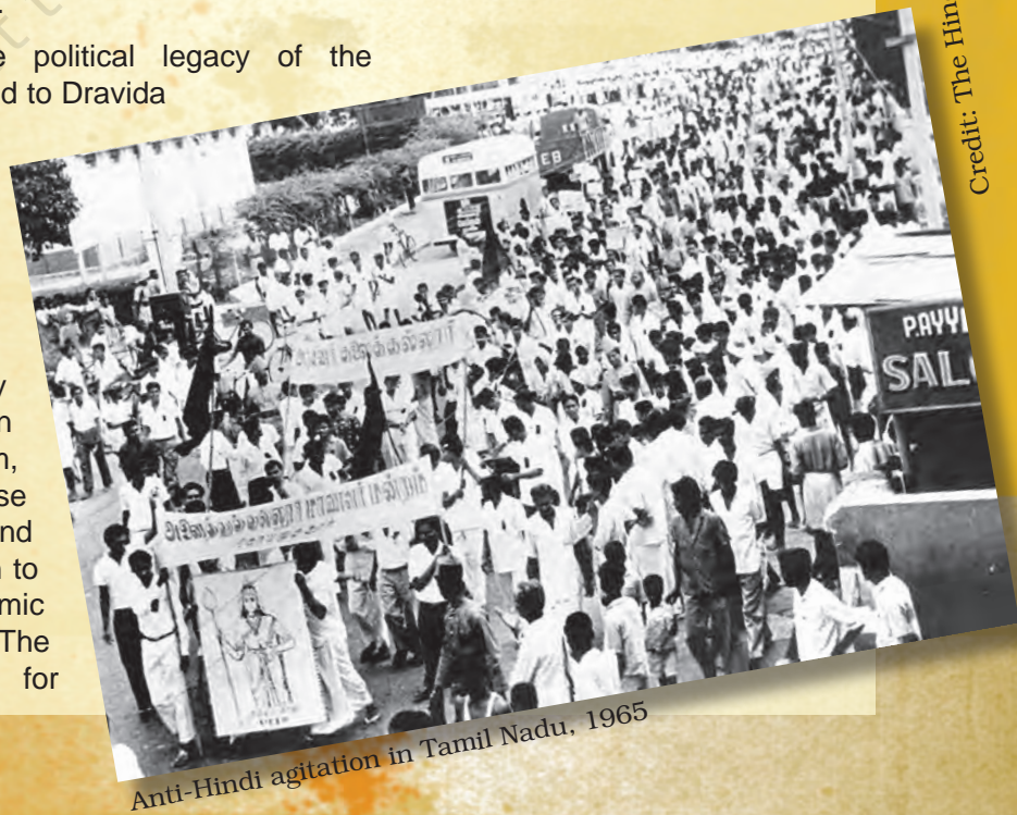
Anti-Hindi agitation in Tamil Nadu, 1965

The DK split and the political legacy of the movement was transferred to Dravida Munnetra Kazhagam (DMK). The DMK made its entry into politics with a three pronged agitation in 1953-54. First, it demanded the restoration of the original name of Kallakudi railway station which had been renamed Dalmiapuram, after an industrial house from the North. This demand brought out its opposition to the North Indian economic and cultural symbols. The second agitation was for