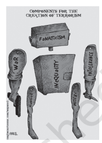
Components for the Creation of Terrorism

A just and lasting peace can be attained only by articulating and removing the latent grievances and causes of conflict through a process of dialogue. Hence the ongoing attempts to resolve problems between India and Pakistan also include promoting increased contacts among people in all walks of life.