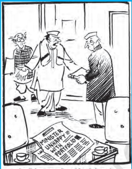
Is that all that matters, the portfolio? The house, the car, the servants, travel, the foreign trips, the security, the secretaries, etc., don't they mean anything to your

Why do people want to be ministers? This cartoon seems to suggest that it is only for perks and status! Then why is there competition for some portfolios?