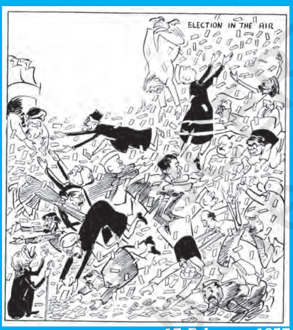
17 February 1957

They say elections are carnival of democracy. But this cartoon depicts chaos instead. Is this true of elections always? Is it good for democracy?