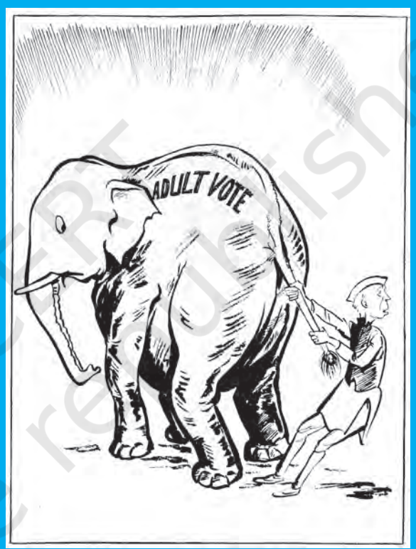
21 October 1951

What is true of the right to vote is also true of right to contest election. All citizens have the right to stand for election and become the representative of the people. However, there are different minimum age requirements for contesting elections. For example, in order to stand for Lok Sabha or Assembly election, a candidate must be at least 25 years old. There are some other restrictions also. For instance, there is a legal provision that a person who has undergone imprisonment for two or more years for some offence is disqualified from contesting elections. But there are no restrictions of income, education or class or gender on the right to contest elections. In this sense, our system of election is open to all citizens.