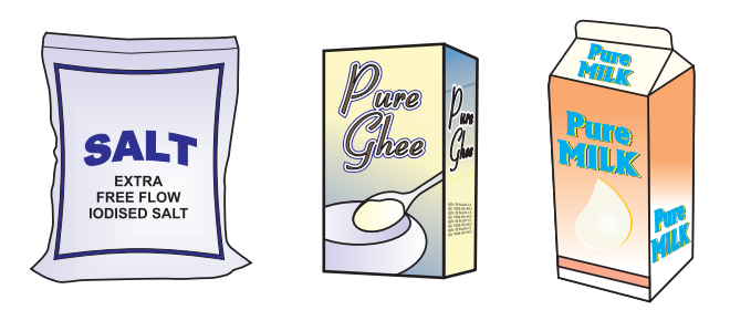
Fig. 2.1: Some consumable items

How do we judge whether milk, ghee, butter, salt, spices, mineral water or juice that we buy from the market are pure?