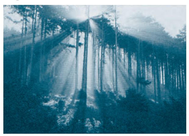
Fig. 2.4: The Tyndall effect

Tyndall effect can be observed when sunlight passes through the canopy of a dense forest. In the forest, mist contains tiny droplets of water, which act as particles of colloid dispersed in air.