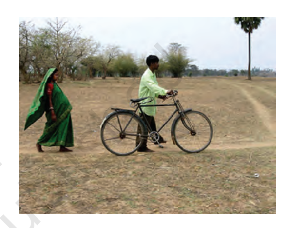
This pregnant lady has to travel many kilometres to see a qualified doctor.