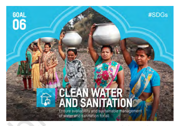
Sustainable Development Goal (SDG) www.in.undp.org

An important part of the Constitution says it is the "duty of the State to raise the level of nutrition and the standard of living and to improve public health."