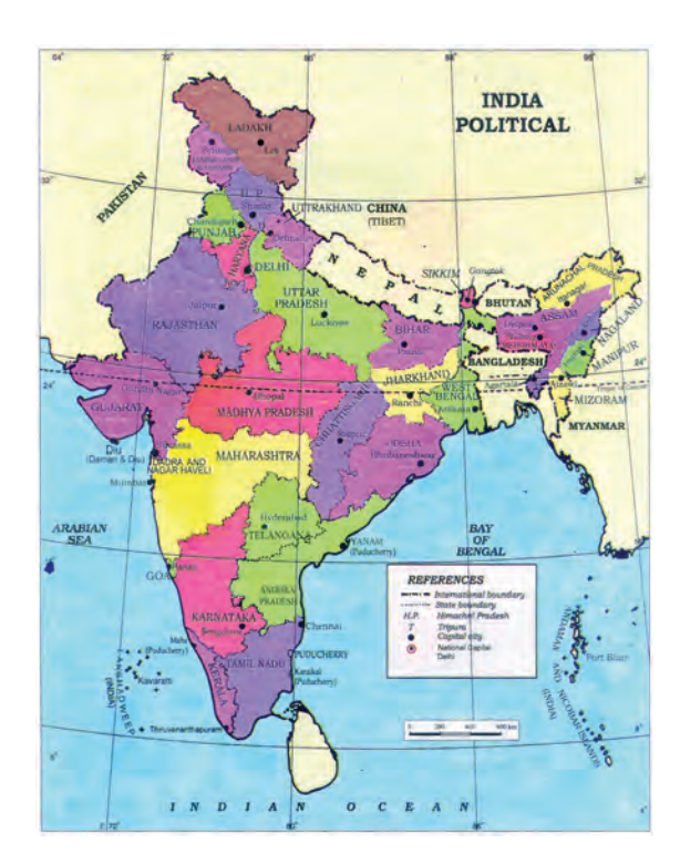
The above map of India shows the state of Kerala in pink.

Page 97 of this book has a map of India. Using your pencil outline the state of Kerala on this map.