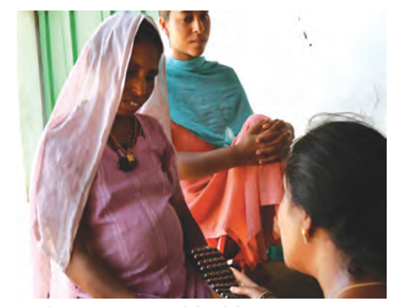
A doctor in a rural health care centre giving medicines to a patient.

As the name suggests, private health facilities are not owned or controlled by the government. Unlike the public health services, in private facilities, patients have to pay a lot of money for every service that they use.