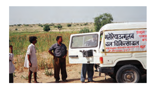
In rural areas, a jeep is often used to serve as a mobile clinic for patients.

Sometimes it is not only the lack of money that prevents people from getting proper medical treatment. Women, for example, are not taken to a doctor in a prompt manner. Women's health concerns are considered to be less important than the health of men in the family. Many tribal areas have few health centres and they do not run properly. Even private health services are not available.