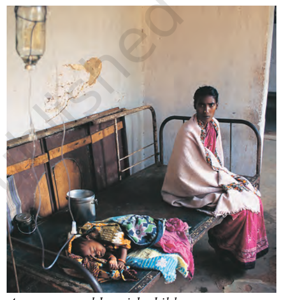
A woman and her sick child at a government hospital. According to UNICEF, more than a million children die every year in India from preventable infections.

In what ways is the public health system meant for everyone?