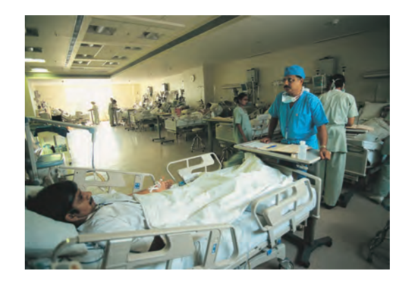
A post-operative room in a leading private hospital in Delhi.

Private health facilities can mean many things. Explain with the help of some examples from your area.