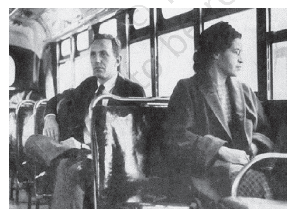
Rosa Parks, an African— American woman, changed the course of American history with one defiant act.