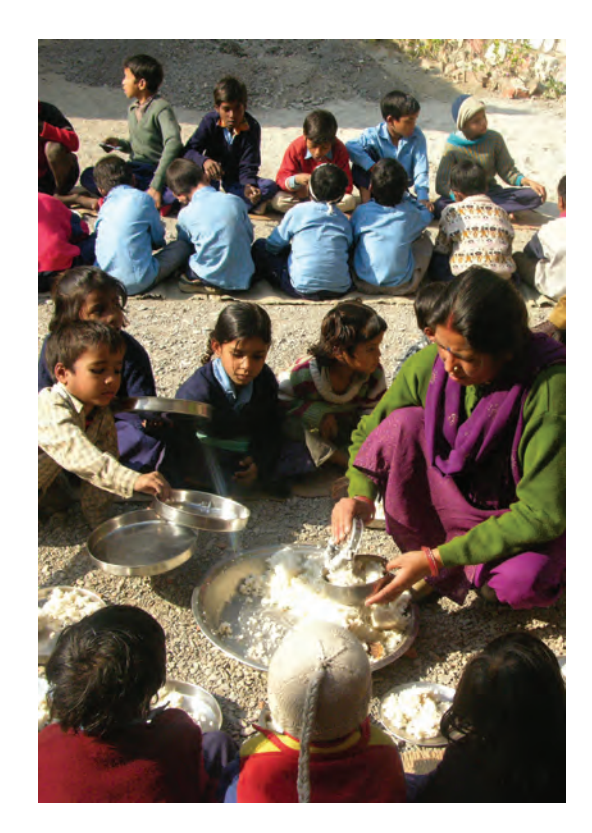
Children being served their midday meal at a government school in Uttarakhand.

What is the midday meal programme? Can you list three benefits of the programme? How do you think this programme might help promote greater equality?