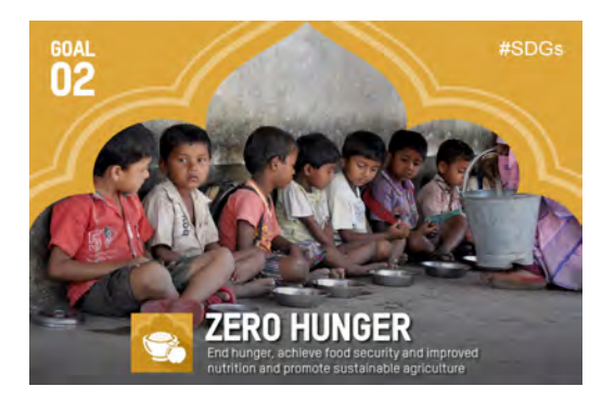
Sustainable Development Goal (SDG) www.in.undp.org

One of the steps taken by the government includes the midday meal scheme. This refers to the programme introduced in all government elementary schools to provide children with cooked lunch. Tamil Nadu was the first state in India to introduce this scheme, and in 2001, the Supreme Court asked all state governments to begin this programme in their schools within six months. This programme has had many positive effects. These include the fact that more poor children have begun enrolling and regularly attending school. Teachers reported that earlier