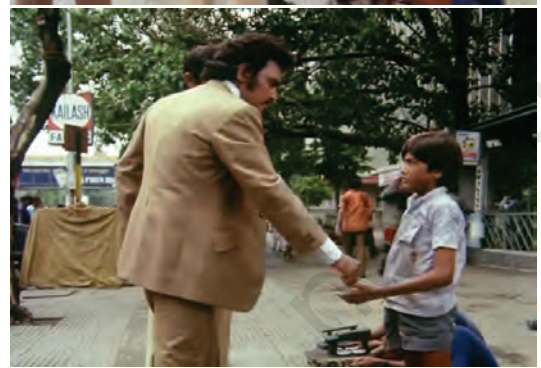
In the 1975 film, Deewar, a boy who works as a shoeshine refuses to pick up a coin thrown at him. He feels that there is dignity in the work that he does and insists that his fee be given respectfully.