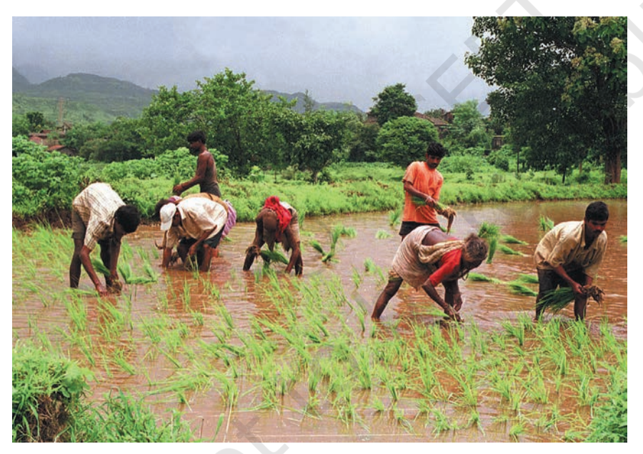
Transplanting paddy is back-breaking work.

The village is surrounded by low hills. Paddy is the main crop that is grown in irrigated lands. Most of the families earn a living through agriculture.