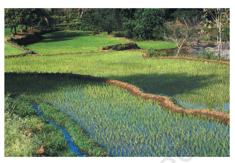
Transplanted paddy growing in a few of Ramalingam's 20 acres. A result of hard labour performed by agricultural workers like Thulasi.