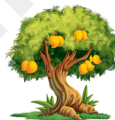
big tree (Future)