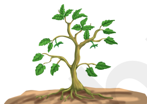
small plant (Present)