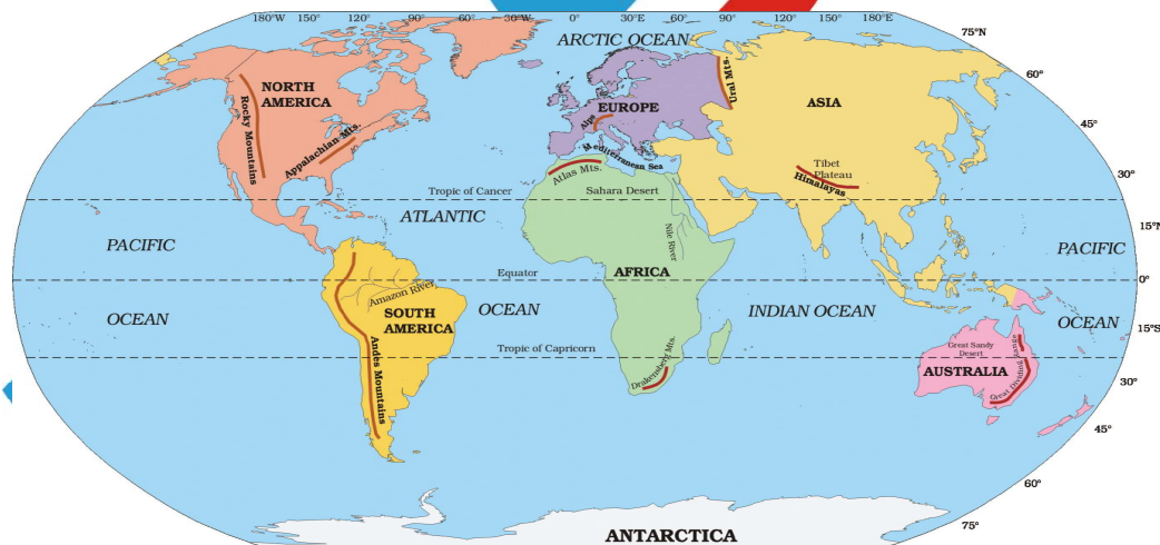
The World : Continents and Oceans

The highest mountain peak Mt. Everest is 8,848 metres above the sea level. The greatest depth of 11,022 metres is recorded at Mariana Trench in the Pacific Ocean.