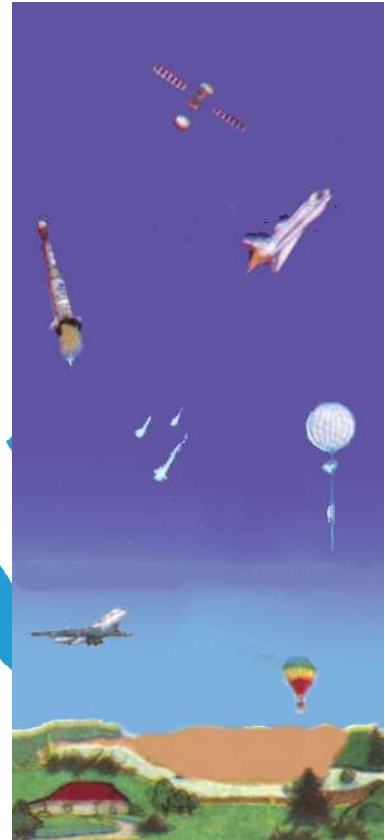
Layers of the Atmosphere

The density of the atmosphere varies with height. It is maximum at the sea level and decreases rapidly as we go up. You know, the climbers experience problems in breathing due to this decrease in the density of air. They have to carry with them oxygen cylinders to be able to breathe at high altitudes. The temperature also decreases as we go upwards. The atmosphere exerts pressure on the earth. This varies from place to place. Some areas experience high pressure and some areas low pressure. Air moves from high pressure to low pressure. Moving air is known as wind.