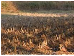
Gleam, rays of light