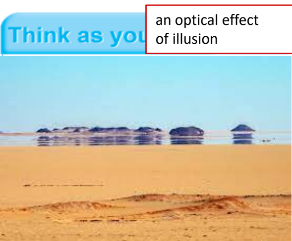
an optical effect of illusion