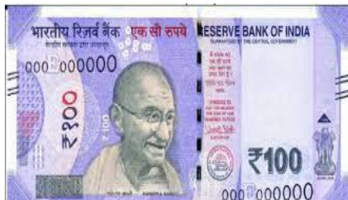
₹ 100 Note