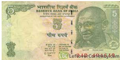
₹ 5 Note

⇒ Below are the commonly used money notes.