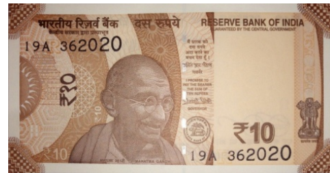
₹ 10 Note