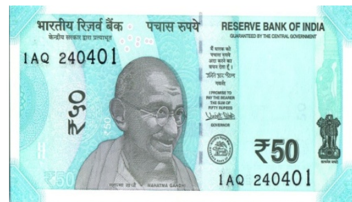
₹ 50 Note