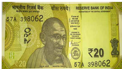
₹ 20 Note