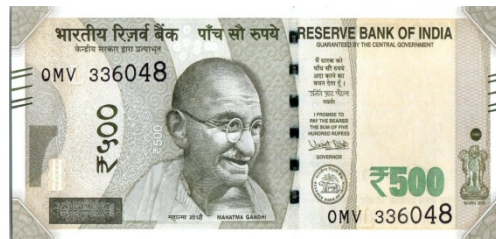
₹ 500 Note