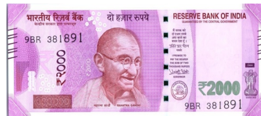
₹ 2000 Note