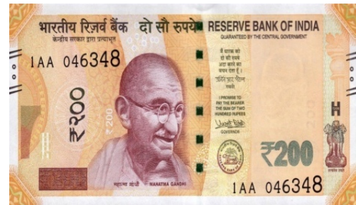
₹ 200 Note