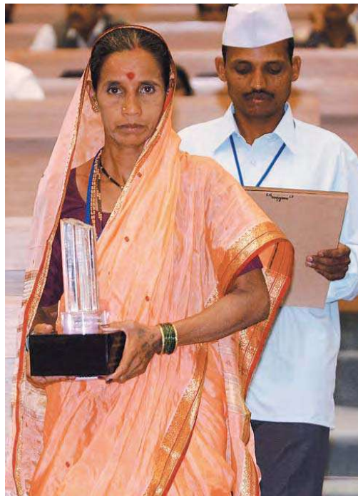
Two village Panchs from Maharashtra who were awarded the Nirmal Gram Puruskar in 2005 for the excellent work done by them in the Panchayat

The Gram Panchayat meets regularly and one of its main tasks is to implement development programmes for all villages that come under it. As you have seen, the work of the Gram Panchayat has to be approved by the Gram Sabha. In some states, Gram Sabhas form committees like construction and development committees. These committees include some members of the Gram Sabha and some from the Gram Panchayat who work together to carry out specific tasks.