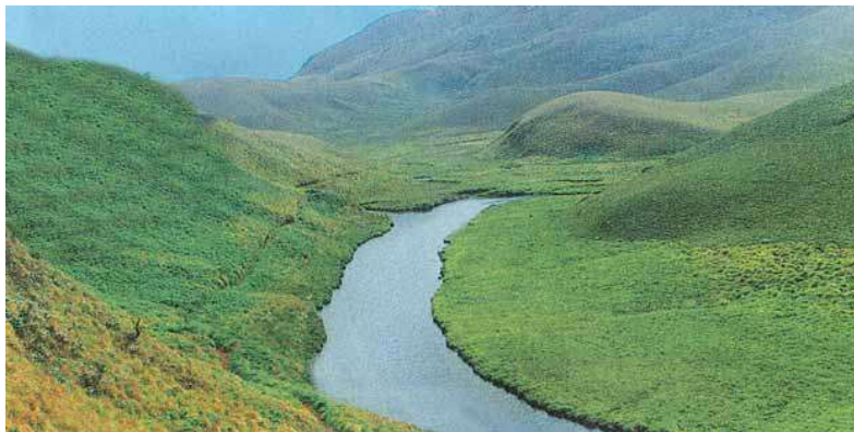
Quiet flows the Cauvery despite being at the centre of heated conflict between two states for the last 30 years.

This means that society does not value the girl and boy child equally and this is unjust. In this context the government steps in to promote justice by providing special provisions that can enable girls to overcome the injustice that they are subjected to. Thus it is possible that fees for girls might be waived or lowered in government schools or colleges.