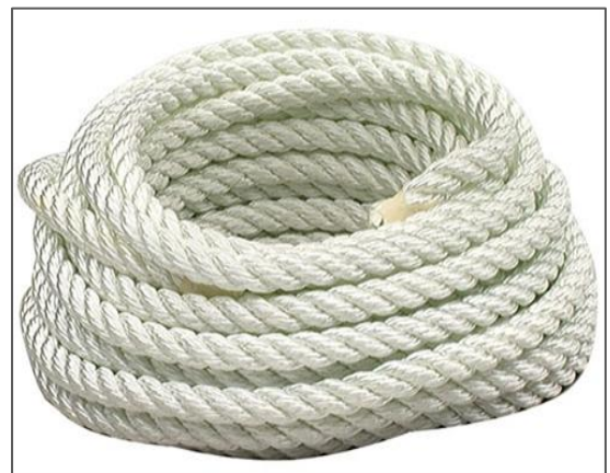
Nylon fibres used in ropes