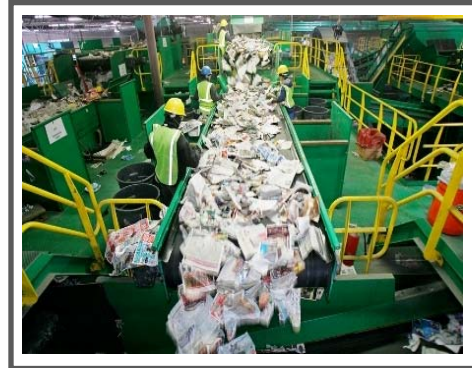
Recycling of Paper

Paper can be recycled five to seven times for use. If each one saves at least one sheet of paper in a day, we can save many trees in a year. We should save, reuse used paper and recycle it. By this we not only save trees but also save energy and water needed for manufacturing paper. Moreover, the amount of harmful chemicals used in paper making will also be reduced. In India, we have some method of paper recycling by way of rag pickers and dealers of old and waste items.