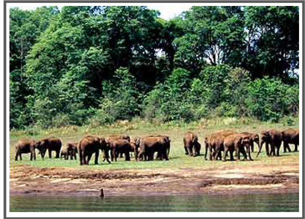
Periyar wildlife sanctuary

Some of the threatened wild animals like black buck, white eyed buck, elephant, golden cat, pink headed duck, gharial , marsh crocodile, python, rhinoceros, etc. are protected and preserved in our wild life sanctuaries. Indian sanctuaries have unique landscapes—broad level forests, mountain forests and bush lands in deltas of big rivers.