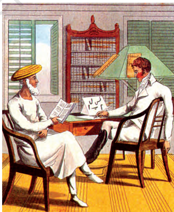
Fig. 1 – William Jones learning Persian

In 1783, a person named William Jones arrived in Calcutta. He had an appointment as a junior judge at the Supreme Court that the Company had set up. In addition to being an expert in law, Jones was a linguist . He had studied Greek and Latin at Oxford, knew French and English, had picked up Arabic from a friend, and had also learnt Persian. At Calcutta, he began spending many hours a day with pandits who taught him the subtleties of Sanskrit language, grammar and