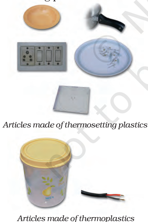
Fig. 3.8 : Some articles made of plastic

On the other hand, there are some plastics which when moulded once, can not be softened by heating. These are called thermosetting plastics . Two examples are bakelite and melamine. Bakelite is a poor conductor of heat and electricity. It is used for making electrical switches, handles of various utensils, etc. Melamine is a versatile material. It resists fire and can tolerate heat better than other plastics. It is used for making floor tiles, kitchenware and fabrics which resist fire. Fig. 3.8 shows the various uses of thermoplastics and thermosetting plastics.