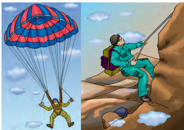
Fig. 3.4: Use of nylon Fibres

also used for making parachutes and ropes for rock climbing (Fig. 3.4). A nylon thread is actually stronger than a steel wire.