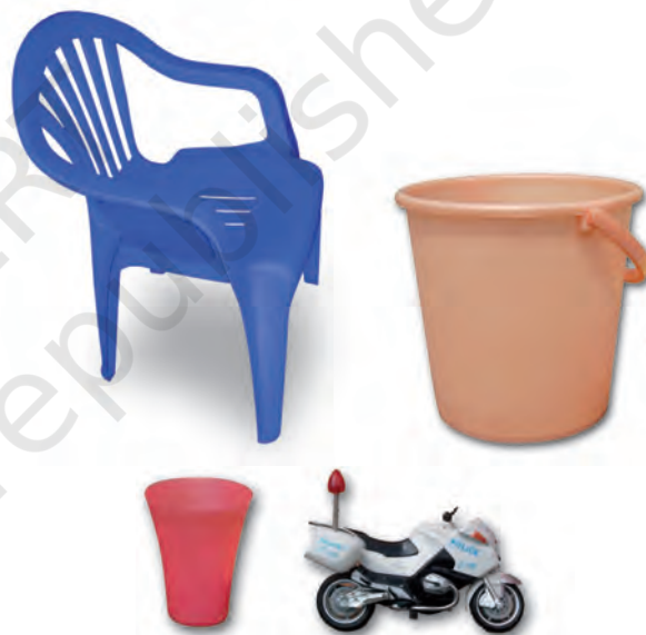
Fig. 3.7 : Various articles made of plastics

Plastic is also a polymer like the synthetic fibre. All plastics do not have the same type of arrangement of units. In some it is linear, whereas in others it is cross-linked. (Fig. 3.6). Plastic articles are available in all possible shapes and sizes as you can see in Fig. 3.7. Have you ever wondered how this is possible? The fact is that plastic is easily mouldable i.e. can be shaped in any form. Plastic can be recycled, reused, coloured, melted, rolled into sheets or made into wires. That is why it finds such a variety of uses.