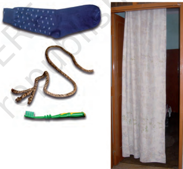
Fig. 3.3: Various articles made from nylon

We use many articles made from nylon, such as socks, ropes, tents, toothbrushes, car seat belts, sleeping bags, curtains, etc. (Fig. 3.3). Nylon is