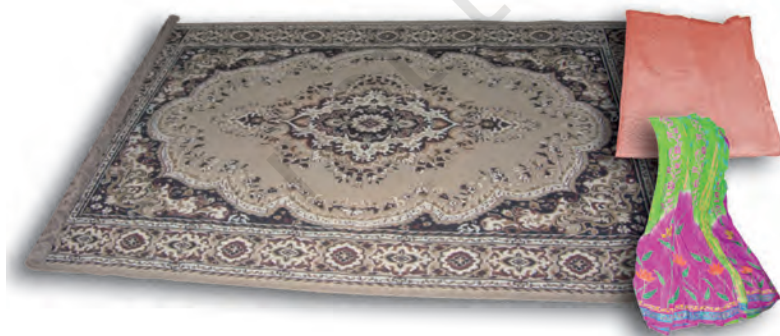
Fig. 3.2 : Articles made of rayon

You have read in Class VII that silk fibre obtained from silkworm was discovered in China and was kept as a closely guarded secret for a long time. Fabric obtained from silk fibre was very costly. But its beautiful texture fascinated everybody. Attempts were made to make silk artificially. Towards the end of the nineteenth century, scientists were successful in obtaining a fibre having properties similar to that of silk. Such a fibre was obtained by chemical treatment of wood pulp. This fibre was called rayon or artificial silk . Although rayon is obtained from a natural source, wood pulp, yet it is a man-made fibre. It is cheaper than silk and can be woven like silk fibres. It can also be dyed in a wide variety of colours. Rayon is mixed with cotton to make bed sheets or mixed with wool to make carpets. (Fig. 3.2.)