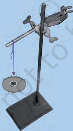
Fig. 3.5: An iron stand with a thread hanging from the clamp

Take an iron stand with a clamp. Take a cotton thread of about 60 cm length. Tie it to the clamp so that it hangs freely from it as shown in Fig. 3.5. At the free end suspend