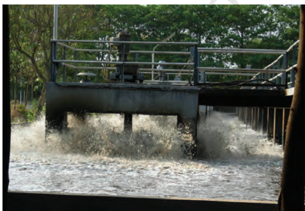
Fig. 18.6 Aerator

After several hours, the suspended microbes settle at the bottom of the tank as activated sludge. The water is then removed from the top.