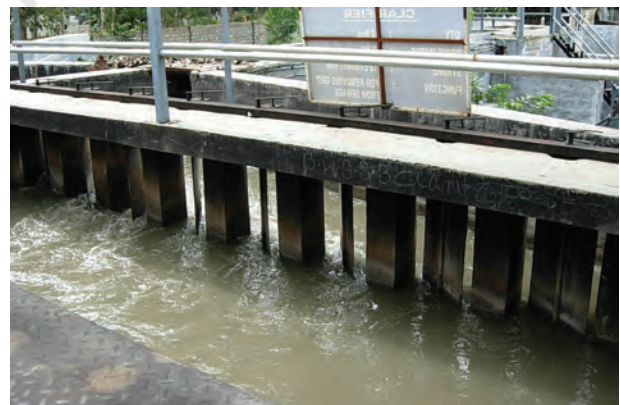
Fig. 18.4 Grit and sand removal tank