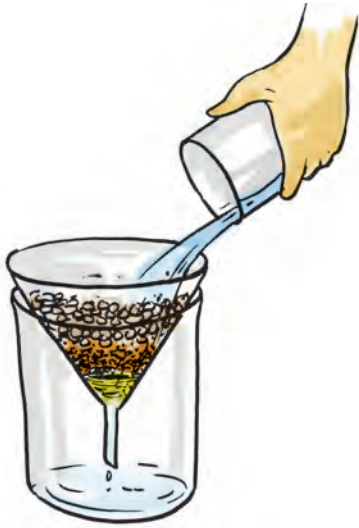
Fig. 18.2 Filtration process