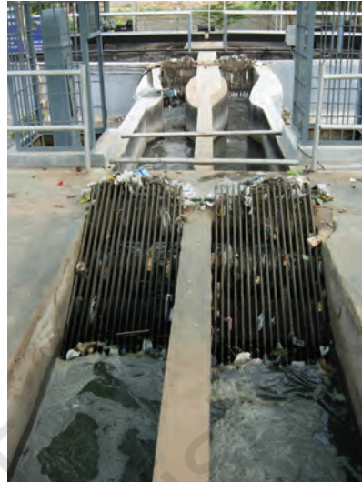
Fig. 18.3 Bar screen