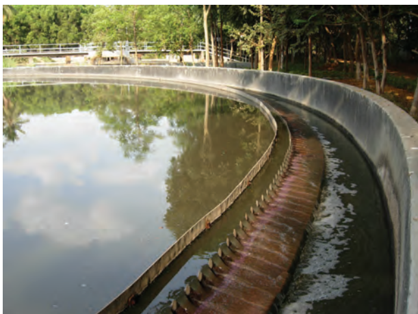
Fig. 18.5 Water clarifier

a scraper. This is the sludge . A skimmer removes the floatable solids like oil and grease. Water so cleared is called clarified water (Fig. 18.5).