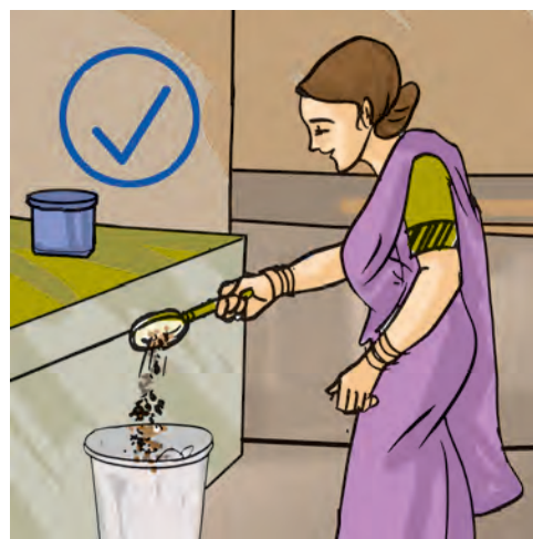
Fig. 18.7 Do not throw everything in the sink