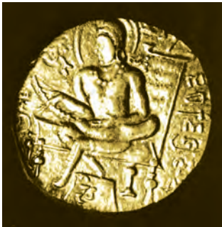
The king who played the veena.

What does this description tell you about the king? And also about how kings fought wars?