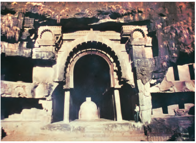
A cave at Karle, Maharashtra

Read page 100 once more. Can you think of how Buddhism spread to these lands?