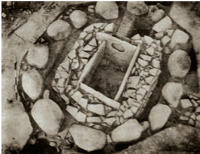
Top : This type of megalith is known as a cist. Some cists, like the one shown here, have port-holes which could be used as an entrance.

Some important megalithic sites are shown on Map 2 (page 14). While some megaliths can be seen on the surface, other megalithic burials are often underground.