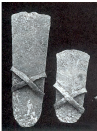
Below : A dagger.