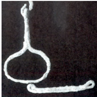
Iron equipment found from megalithic burials.