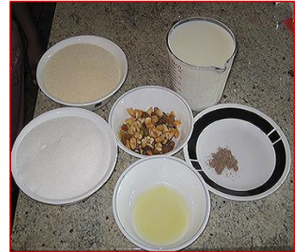
Ingredients to make Halwa

Ingredients are the food materials required to prepare a dish. For example to make halwa we need milk, suji, dry fruits, sugar, ghee and cinnamon powder.